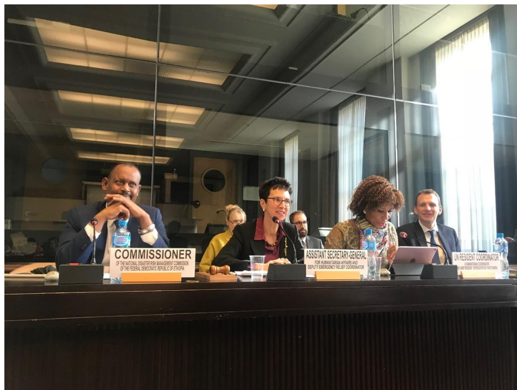
Gov't and UN presenting Ethiopia humanitarian situation to member states in Geneva

Requirement for 2018 Ethiopia Humanitarian and Disaster Resilience Plan